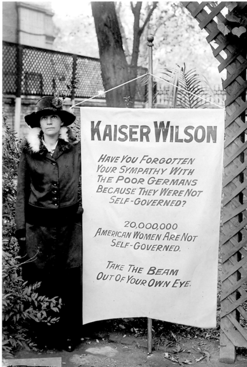
Still Pictures Branch, National Archives at College Park.

Source: National Archives, Photograph, 1918.